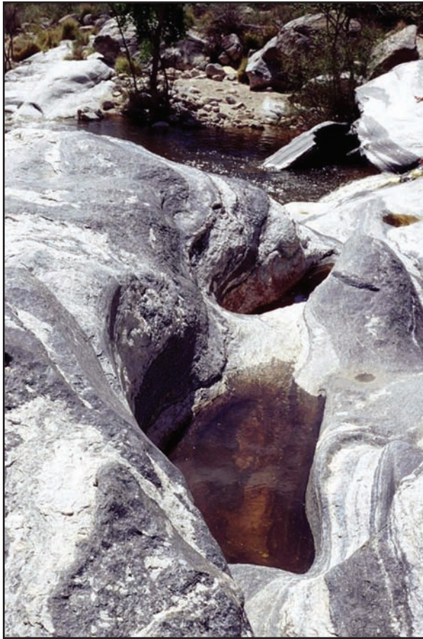
TINAJAS