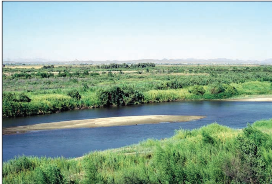
COLORADO RIVER (Richard Moore)

It is .6 miles to this prison whose nickname was the "Arizona Hellhole." From 1876-1909, this was probably the most infamous prison in the U.S. 3,049 men and 29 women served sentences here (which included 217 murderers and 11 polygamists) during its 33 year reign. The cornerstone of the prison was laid on April 28, 1876 and the prison opened on July 1, 1876 and closed on September 15, 1909, when the last prisoners were moved to the new state prison in Florence, Arizona. 26 prisoners successfully escaped while 8 were killed in attempts for freedom. The largest escape occurred on October 27, 1887, when 7 prisoners escaped, 4 were killed and 1 wounded in the attempt. According to Yuma State Park Rangers, the cemetery contains 107 documented graves, while the "official" count is 104. Whichever is accurate, it is a testament to the harsh living conditions that were encountered here. The longest stretch in solitary confinement (the "Snake Den") was 88 days; the same prisoner later served a second term in solitary and died there.