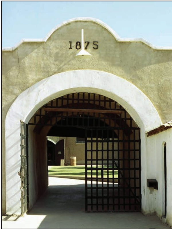
YUMA PRISON SALLYPORT

In 1910, the prison became a school and served as such for 4 years until a “real” school could be constructed. Today, Yuma High School still uses “Criminals” as its mascot and nickname. In addition to seeing the “snake den” and other cells, visitors may view an excellent exhibit on the female prisoners that served terms here. Visitors may also don prison garb and have their “mug shot” taken (use your own camera).